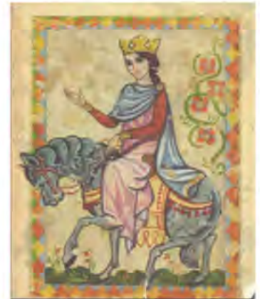
1 - Eleanor of Aquitaine (1122-1204) was one of the most powerful and wealthiest women in western Europe during the High Middle Ages. She was Queen of France (1137-1152) and then Queen of England (1154-1189). She was the mother of Richard the Lionheart.

We had a break for lunch then off Cubs went again to find more great bases. It was a really hot sunny day, so the water bombs fired at Cubs by a huge trebuchet was very popular!